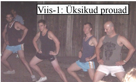
Viis-1: Üksikud proudad