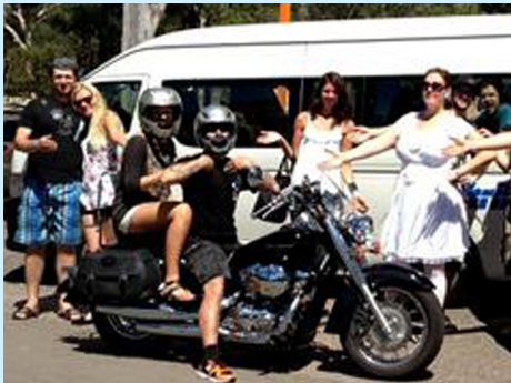
Meie liiklusvahendid- buss, mis ei tahtnud kuidagi tervena püsida ja tsikkel

Keep up to date with their travels at www.ohhtuleht.ee/blogid/neiudaustraalias