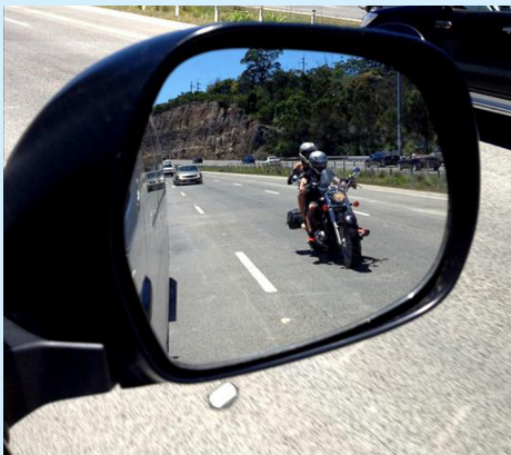
Kes bussiga, kes tsikliga