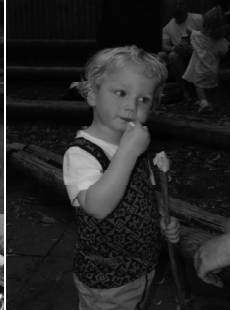
Kalev, although you attacked Eggbert we still love you