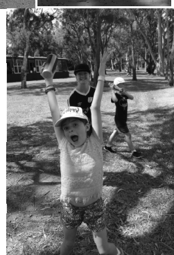
This sports fan just can't get enough