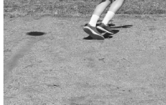
It's a Thrilleerrr