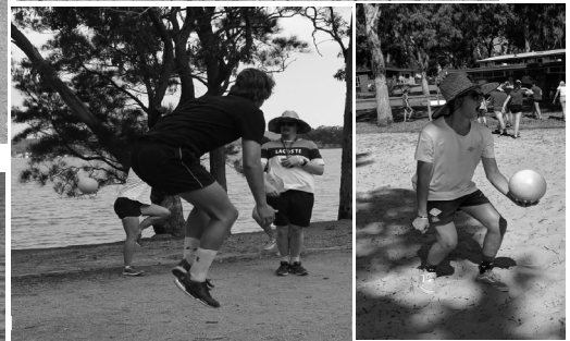
"I say jump, you say..."