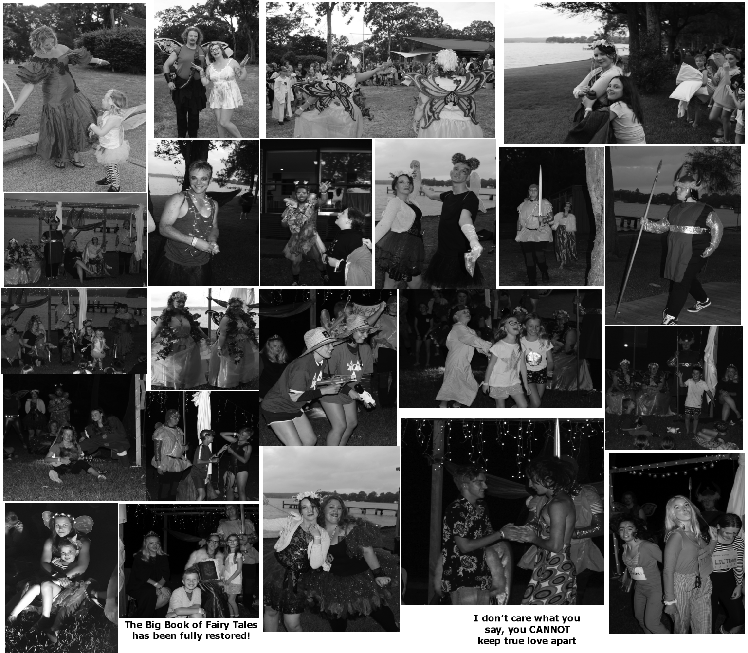
The Big Book of Fairy Tales has been fully restored!