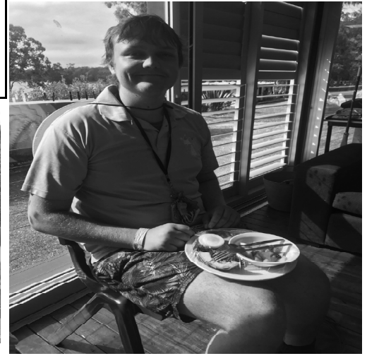
Bribery is the best policy